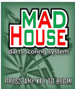
MadHouse Title Screen

> MadHouse is compatible with most popular mobile handsets (range TBA - currently all phones with or above a 176x208 screen resolution are supported).