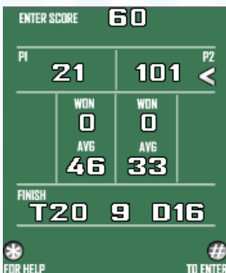
Screenshot of Original 301